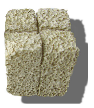
Head decoration (make 1): Glue five blocks as shown.